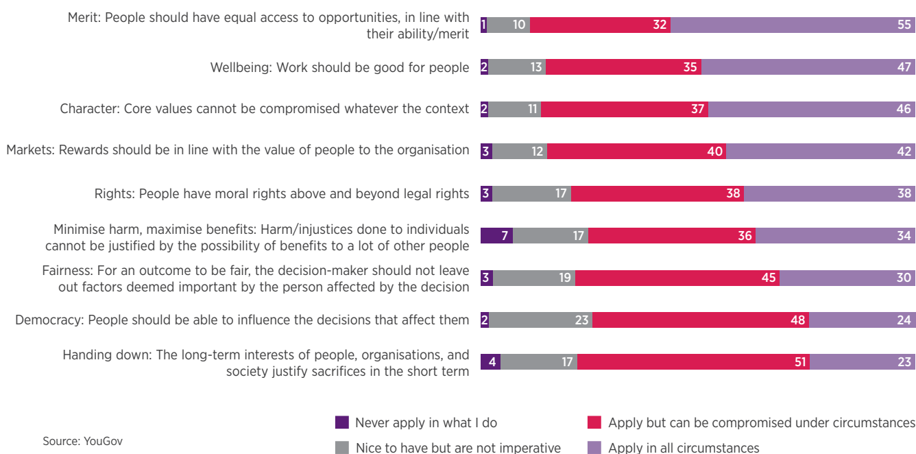
Figure 2: Application of principles by practitioners (%)

This is in contrast with what the practitioners think is the ‘right’ thing to do when asked about good professional practice, as opposed to their current practice. For instance, in balancing the interests of the business and its people, the respondents recognise individuals as legitimate stakeholders in the work